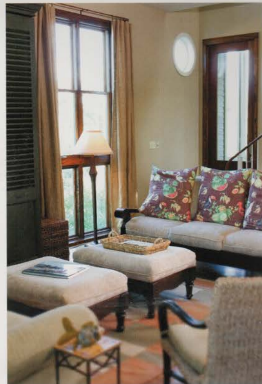
Above: The open stairway creates a visual backdrop for the living room and accentuates the room's 11-foot tall ceiling. The loose arrangement of seating areas and dining space makes for an inviting home comfortable for casual entertaining, extended-family gatherings, or a quiet weekend for two.