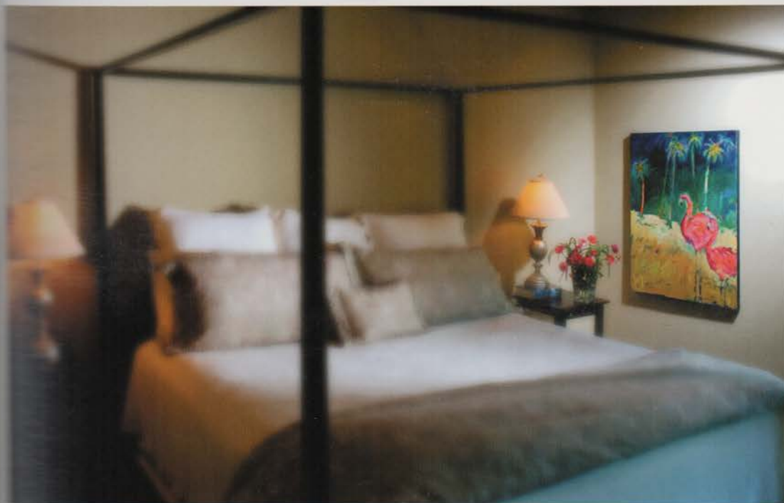
Carolyn's paintings are placed in every room of the house, including the two upstairs master suites.