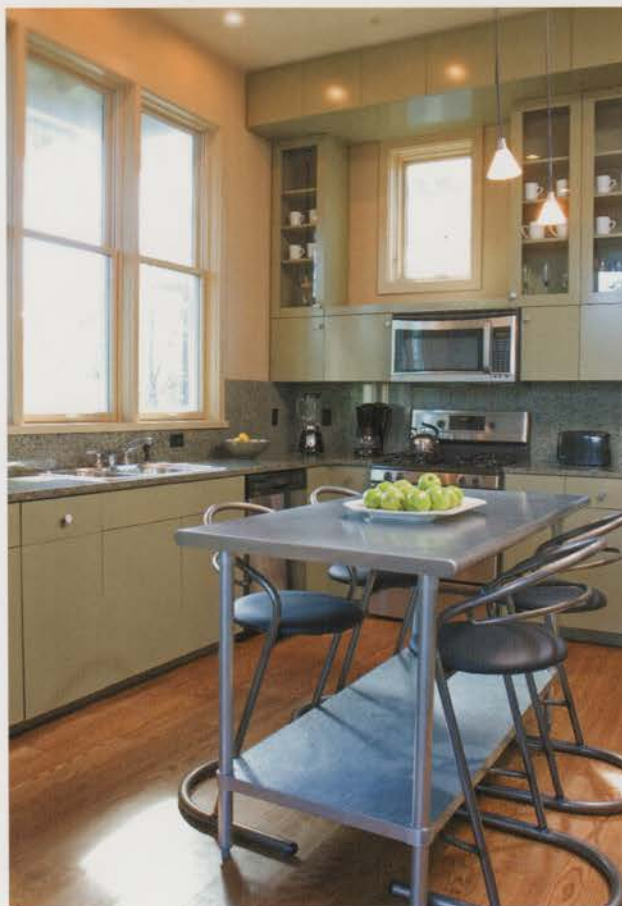
Above: The kitchen stands as its own delightful space—not huge but functional and attractive with a stainless steel central island, tall cabinets, sleek appliances, and granite counters.

From the beginning, the Goldsmiths planned to place the house on the WaterColor rental program to help cover expenses. They wanted a home that suited their personalities and lifestyles, as well as renters who would stay in the house. Upstairs are two master suites, allowing two couples to share the home at the same time. The large corner lot also accommodates a separate carriage house